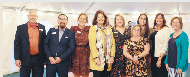
Staff welcomed new and current board members to the Foundation office for board orientation as we looked ahead to a new year of community giving in our region.